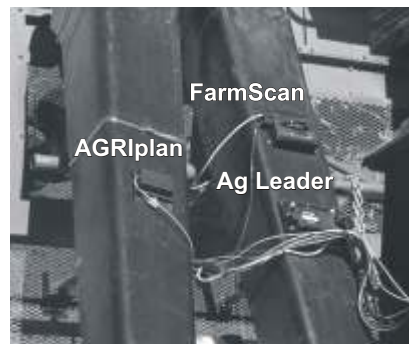
Agri-Plan, FarmScan, and Ag Leader sensors mounted on chutes 3 and 4 of the NESPAL John Deere 9965 cotton picker during evaluation. Sensors were also mounted on chutes 1 and 2.

installed on 2, 4 or 6 ducts (see table 1 below). Cables from the sensors on the ducts lead to the cab of the picker where a user interface console is installed. The console receives and processes data from the sensors, displays yield information and stores the data for later use.