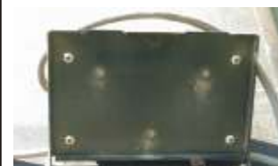
Yield monitor sensor in an open position. This sensor has 3 photo detectors.