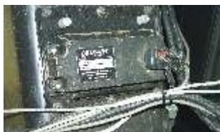
Yield monitor sensor in a closed position mounted on the front of a chute.