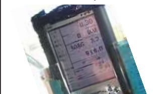
User interface – Compaq iPAQ®.