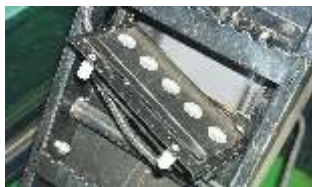
Yield monitor sensor in an open position. This sensor has 5 photo detectors.