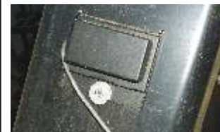
Yield monitor sensor in a closed position mounted on the front of a chute.