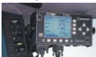
User interface – PF3000.